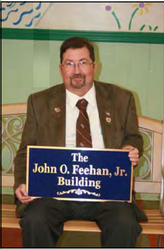
Blue Ridge Opportunities Building Dedication February 21, 2008