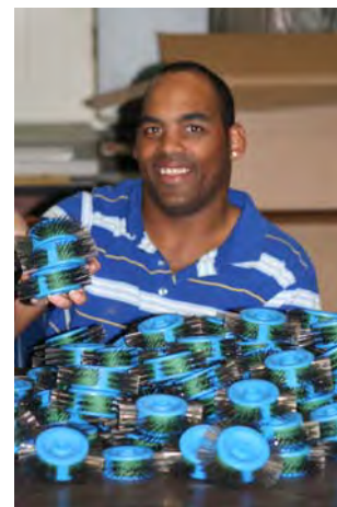
Making specialty brushes helps foster skills.

With our expanded and strengthen programs, we have experienced steady growth as the community and its businesses have seen the economic value of our services. As a result, we are having to continue with a strategic expansion